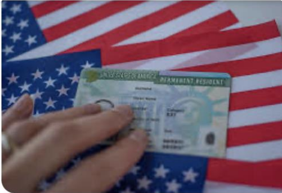
Law Office of Parviz Malakouti

People who are not born in the United States need special papers to stay and live here forever.