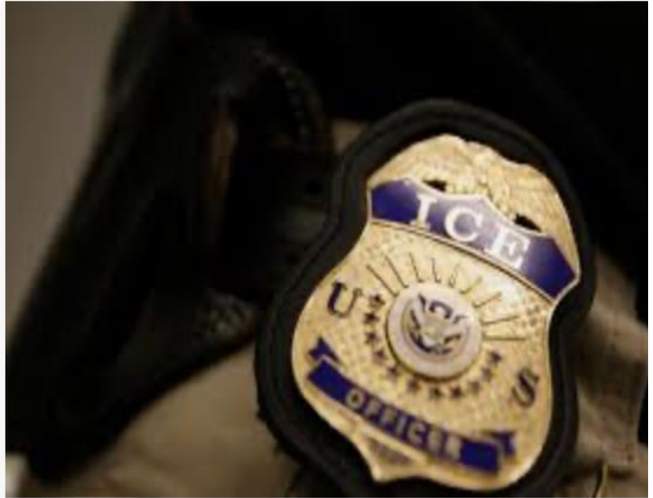
The Salt Lake Tribune

It's what happens to some parents when they are taken by ICE , a group of people who check if others have those papers to stay in the U.S.