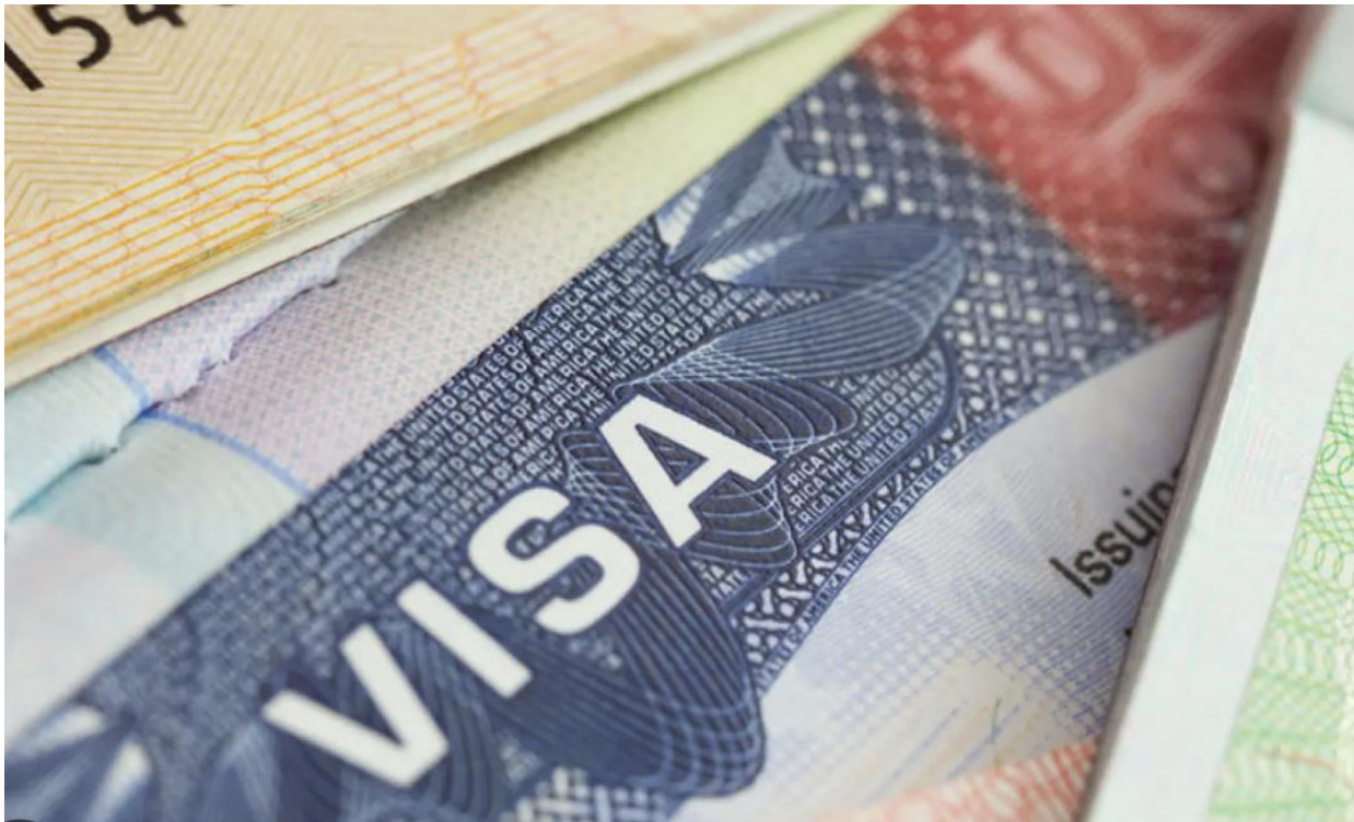
US Visa Service

Immigrants need a Green Card or a Visa, like a pass, so they can stay in the U.S.